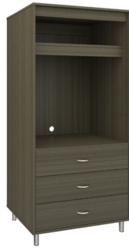
Model: A2AMTV30 34.75W 24.75D 72.25H

Taking on a new twist from an old classic, the Atlanta II re-invents itself by adding feet for a wonderful new design with tried and true appeal. Cleaning and maintenance are simple and easy when case goods are elevated. Available with or without contrasting edges as well as custom color combinations. The product is required to be wall mounted for safety. Using the kit provided, please follow provided instructions exactly.